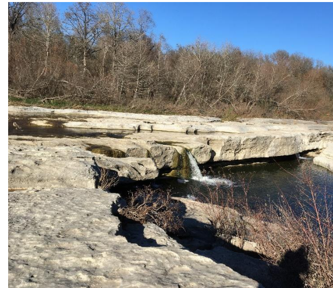
Lower Falls at McKinney Falls State Park

10Km/6Km Walk – “B” Awards Event ID: SW22 / 121299 AVA – 77, TVA -24