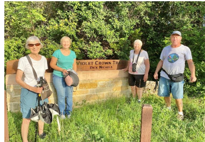
Walkers enjoying the Violet Crown Trail

10Km/5Km Walk Event ID: SW17/ 119028 AVA - 77, TVA -24