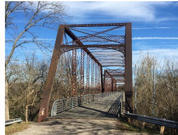
Moore's Crossing Bridge

10k/6k Walk Event ID: SW20/116360 AVA - 77, TVA - 24