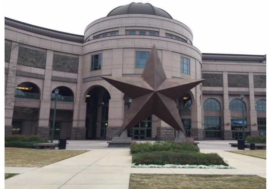
Bob Bullock State History Museum

11Km/5Km Walk Event ID: SW19/113686 VA-77, TVA-24