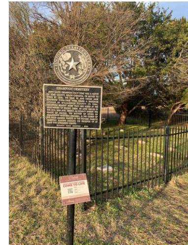
Champion Family Cemetery

6/10k Walk Event ID: SW19/ 113543 AVA – 77, TVA -24