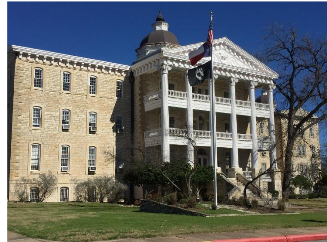
Austin State Hospital (ASH) built 1857